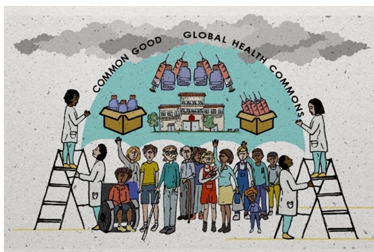
Tonia Lentzou / CC BY-NC 4.0

However, the USA has been reluctant to implement fair pricing or access policies for these strategic innovation initiatives.