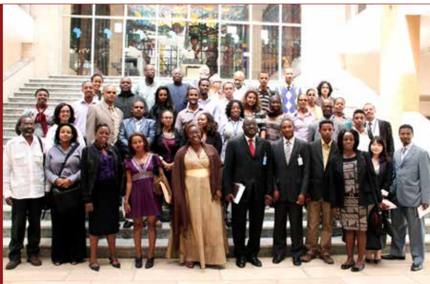
Group Photo of the High level Colloquium on the theme: "Democracy, Governance and the Pan-African Idea: Whither Africa?" inside Africa Hall, UNECA.

tive to have robust debates on Pan-African institutions underpinned by democratic spirit especially, on shared values as indicated by the African Union Commission (AUC). It is also important to draw out lessons from the largest democracy in the World like India on how to build institutions that promote democracy;