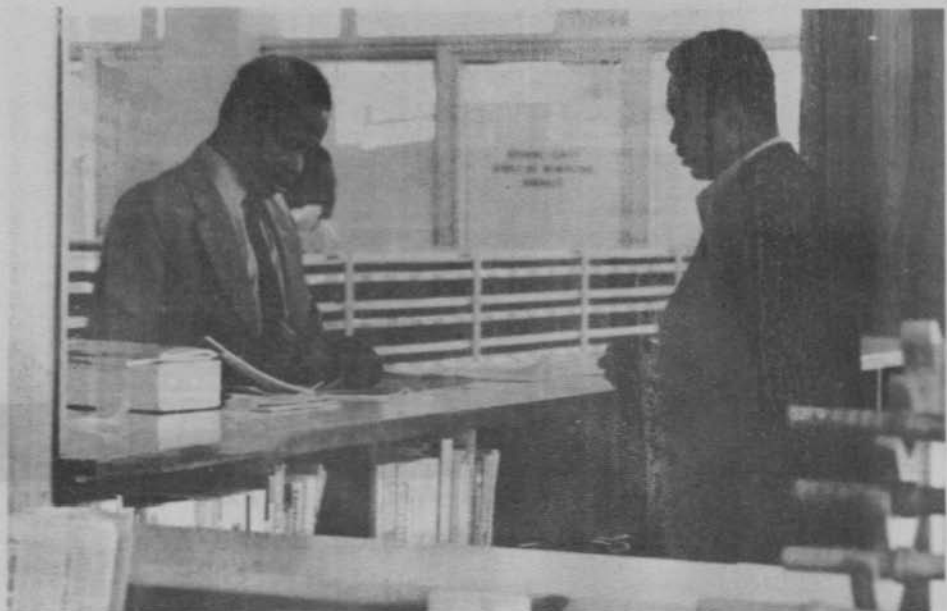
Main Library - Information Desk