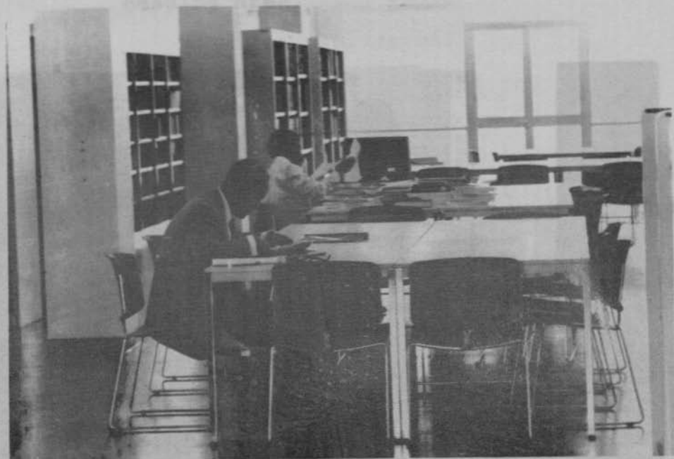
Government Publications Unit - Reading Area