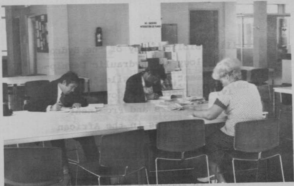
- Government Publications Unit - Reading Area