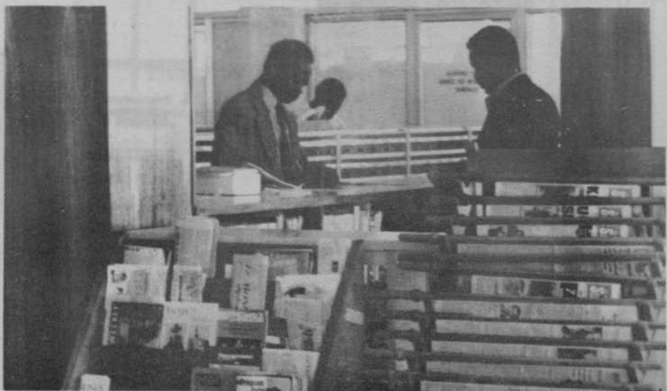
Main Library - Newspapers and Periodicals Area