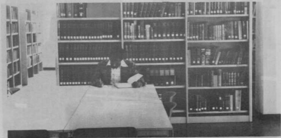
Main Library - Reference Books Area