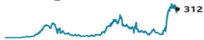
Fig. 4: Global COVID-29 deaths per 100 000 population; 11 July 2021